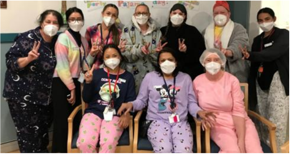
Pyjama Day Staff