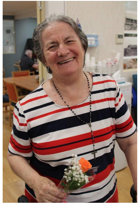
Lone Valentine's Day