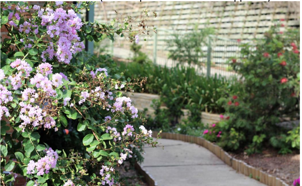
Garden at the Back