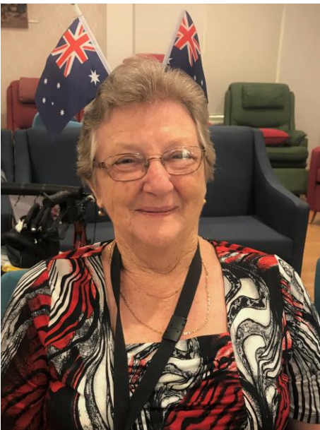
June Australia Day